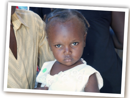
"Haiti's children suffer the most..."

The hungry resort to eating tree bark, rock and a dirt clay, called "te." One in ten children dies before the age of five.